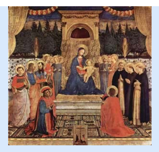
San Marco Altarpiece (w)Commissioned by the Medici family in 1440.