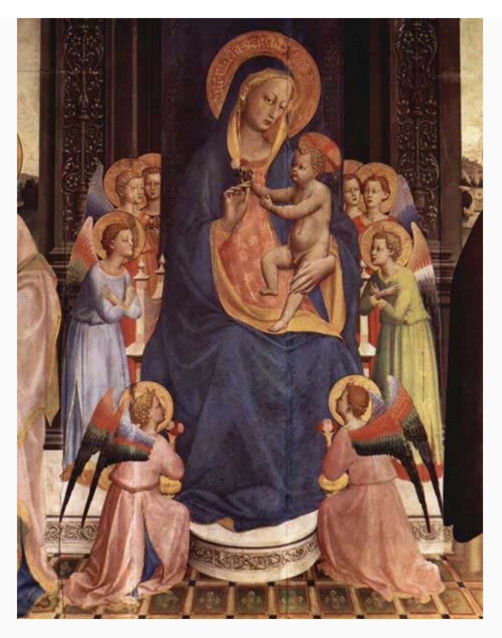
Virgin and Child with Saints. Fiesole, Italy. (w)